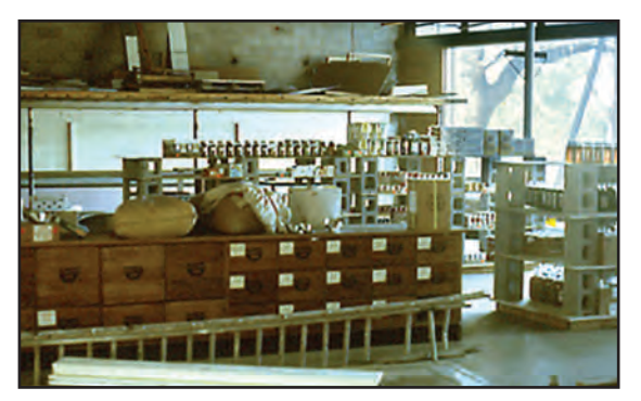
Setting up the original store in March 1976.

Guadalupe that was executed in 2008-2009.