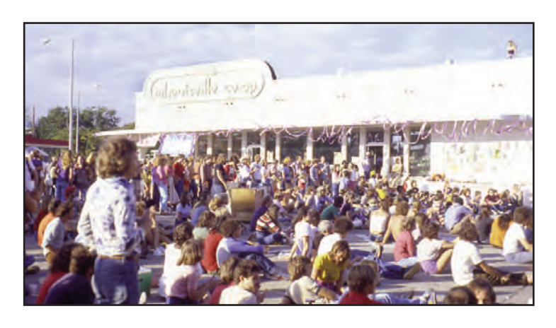
Our Grand Opening Party at 3101 Guadalupe in 1981.

At the beginning we were here because of our founding owners (some of whom still shop here) and today we're here because of all of you! We are literally nothing without our amazina owners Thanks and Happy Birthday to US!