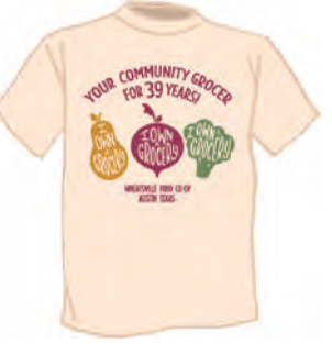
Our limited edition 39th Birthday T-shirt will be available in March.