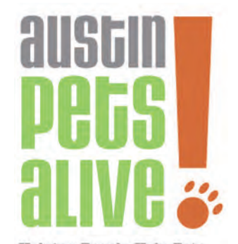
Helping People Help Pets

Wheatsville's community action group for the month of March is Austin Pets Alive! Austin Pets Alive! has saved more than 25,000 dogs and cats since 2008. APA! has continuously been voted by our owners as one of Wheatsville community action group for many years now. Austin Pets Alive! focuses solely on the pets who have been passed over by other shelters' adoption programs and have no other options. Austin Pets Alive! is committed to making Austin a no kill city.