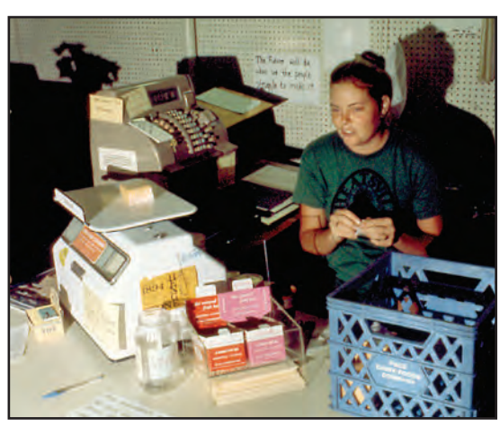
Our check-out in 1976. The sign on the wall reads, "The future will be what the people struggle to make it." The rolling papers are next to the scale.